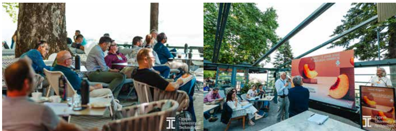
> Attending crowd of the X International Peach Symposium.

The X ISHS International Peach Symposium took place from 30 May to 3 June 2022, in the city of Naooussa, located in the Prefecture of Macedonia, Greece. Naooussa is a historical landmark because it is where the greatest philosopher, Aristotle, taught classical Greek thought and the ideals of Platonic philosophy to the son of the King of Macedonia Phillip II, Alexander, and the other nobles of the court. Notably, Naooussa is the place where peach production was first introduced in Greece, in 1938. In addition, Naooussa and the wider regions of Imathia and Pella are the epicenter of peach fruit production in Greece with leading cooperative units with international impact and a worldwide leading role in the canning industry. The symposium was the first held in an open-air environment with the employment of state-of-the-art audiovisual infrastructure. The venue was located within the Municipality Park of